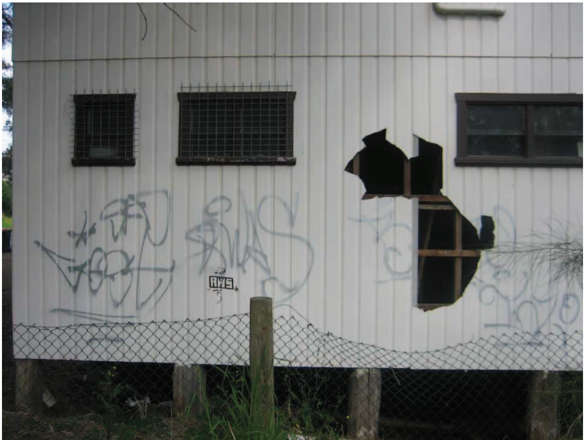
NORTH SIDE WITH HOLE PUNCHED THROUGH WALL