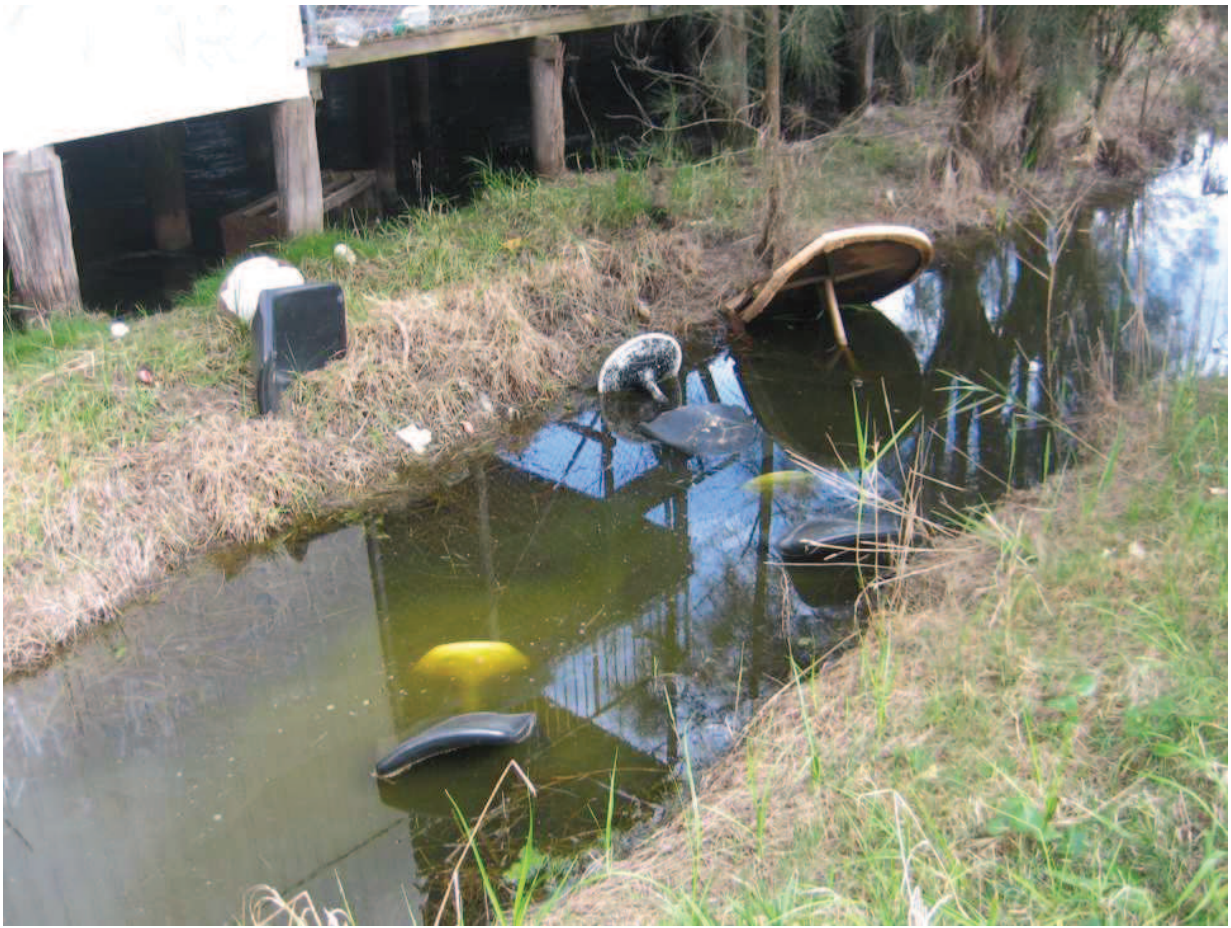
STORMWATER DRAIN WITH ITEMS THROWN FROM BUILDING