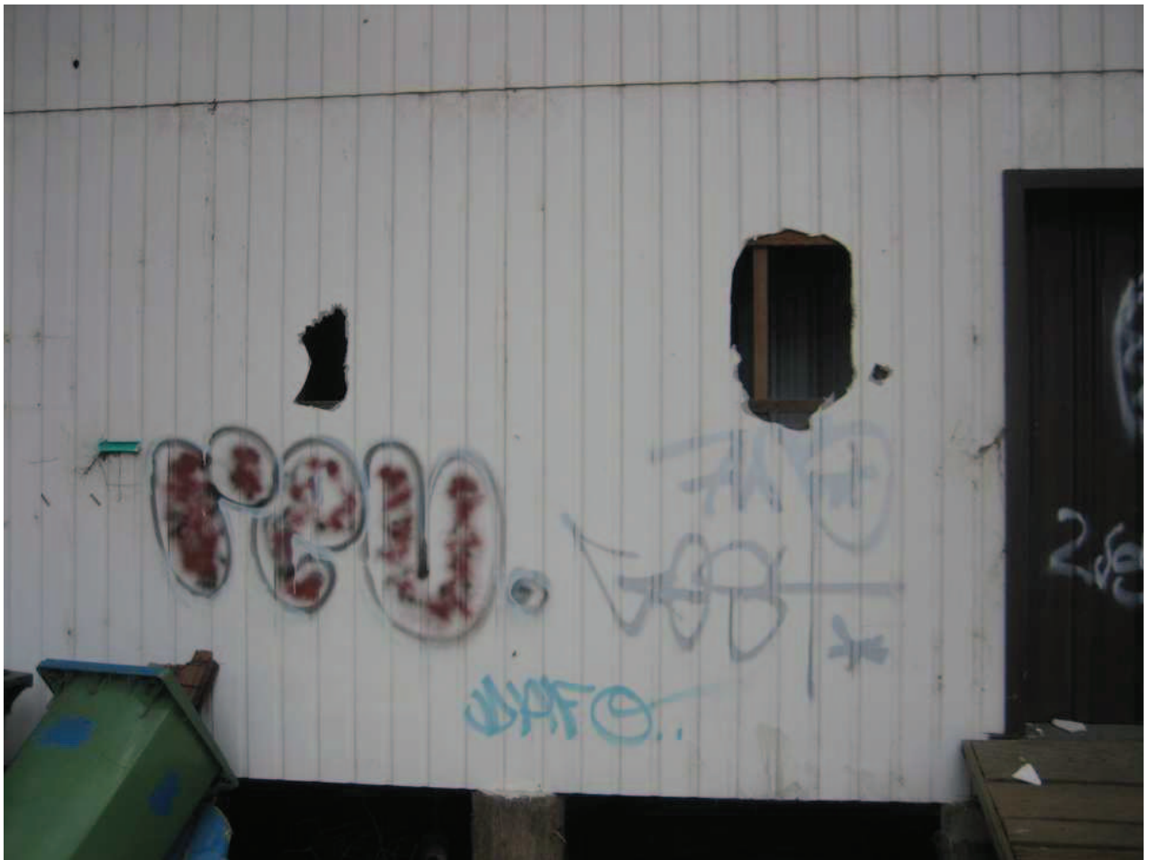
FRONT WITH HOLES PUNCHED IN WALL