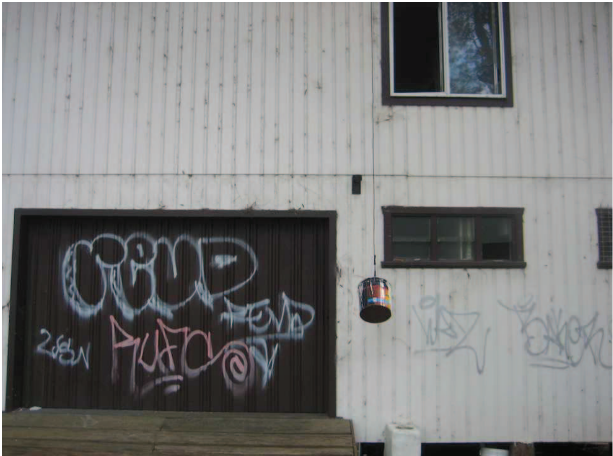
FRONT SHOING BUCKET HUNG FROM BROKEN WINDOW

3rd September, 2010 TEPCP again contacted WSC advising of further vandalism to the building. TEPCP has been advised that the damage to the building is now so severe that it is only suitable for demolition.